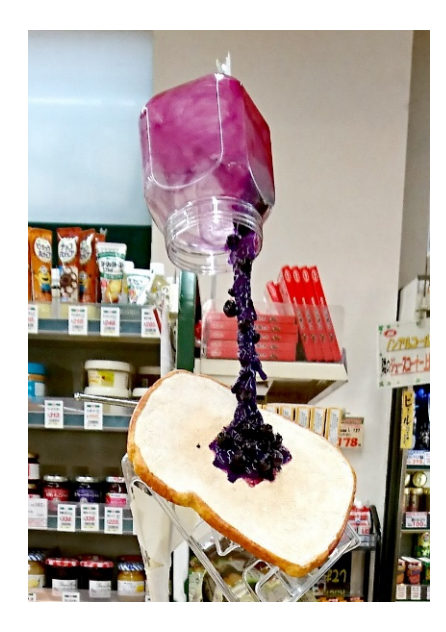
Fig. 2. The eye-catching object.

Many studies have considered the psychological mechanism, and have verified its effectiveness. Sherman [8] proved the principle in an experiment about volunteer work at the National Cancer Institute. First, Sherman asked the subjects through a questionnaire if they were willing to volunteer. Participants knew that they had no obligation to participate in volunteer work. Consequently, many subjects answered yes, and 31% of all subjects took part due to commitment and consistency while 4% did so without the questionnaire. Greenwarld et al. also succeeded in improving the turnout rate using the same method [9]. However, these results might be because doing volunteer work or voting are considered morally right things to do. That is, the subjects hesitated to say "NO" so they chose "YES" leading to an increase in the volunteer participants and the votes received. Thus, highly social behavior may lead to YES answers and intended behavior.