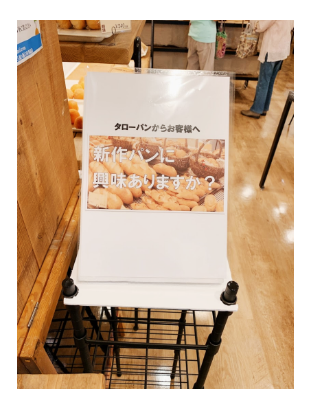
Fig. 6. The questionnaire only under condition B.

By comparing these three conditions, we examined how effective the button was for promoting food tasting. Under