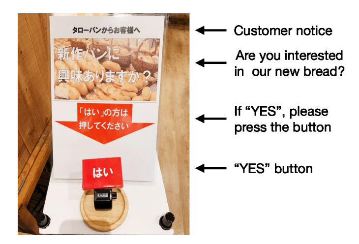
Fig. 3. The shikake to promote tasting.