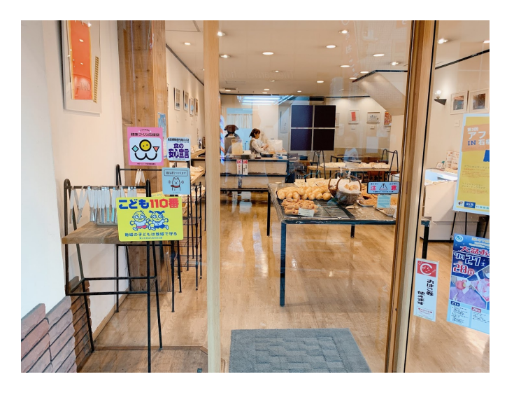
Fig. 4. The bakery.