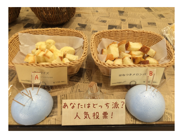
Fig. 1. Voting-style food tasting.

According to Matsumura [2], [3], a shikake is an embodied trigger for behavior modification to solve social or personal problems. It only increases the individual's choice of action and does not force them. It encourages people to voluntarily choose by making their choices look more attractive. Common methods such as pop-up ads or tasting by salespersons have resulted in consumers feeling psychological resistance to sales promotions, creating further resistance. However, shikakes attract the attention of customers to try tasting a product